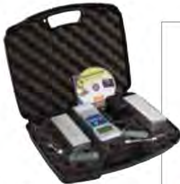
Pull Test Kits provide an accurate record of magnetic strength over time.